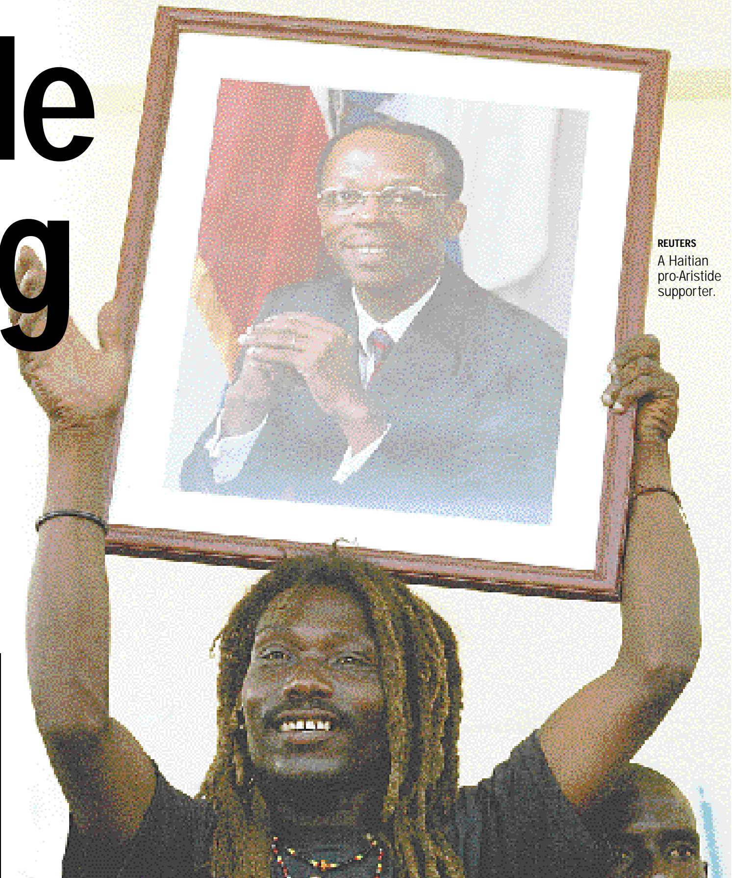
A Haitian pro-Aristide supporter.